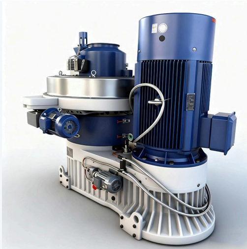
🌲 Ring Die Biomass Pellet Mill · Efficient & Stable Operation