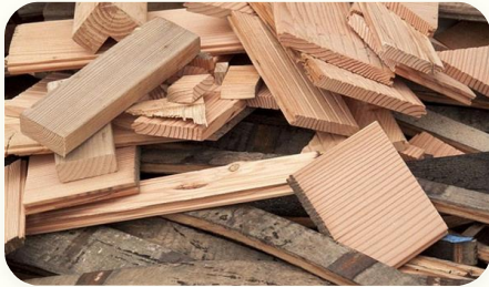
🌲 Wood chips