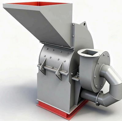
Multi-functional Wood Crusher · International Quality