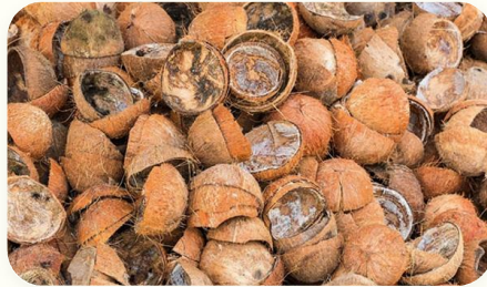
🥥 Coconut shell