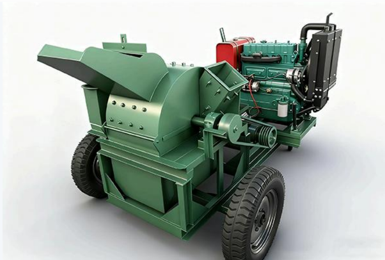
Mobile Multi-functional Wood Crusher · Efficient & Stable Operation