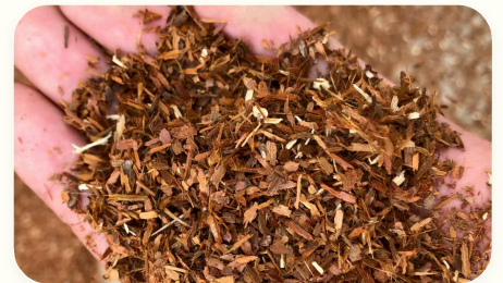
🔹 Mushroom substrate