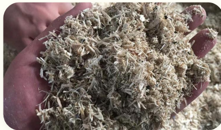
🔹 Biomass pellet raw material