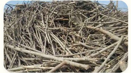
🍂 Garden waste