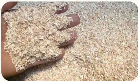
🔹 Wood chips 1~20mm