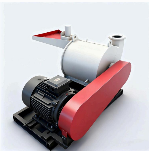
Horizontal Wood Powder Machine · Efficient & Stable Operation