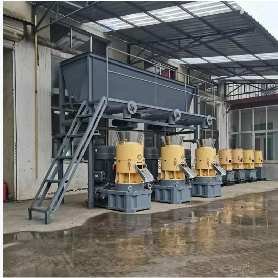
⚙️ Flat Die Biomass Pellet Mill · CE Certified