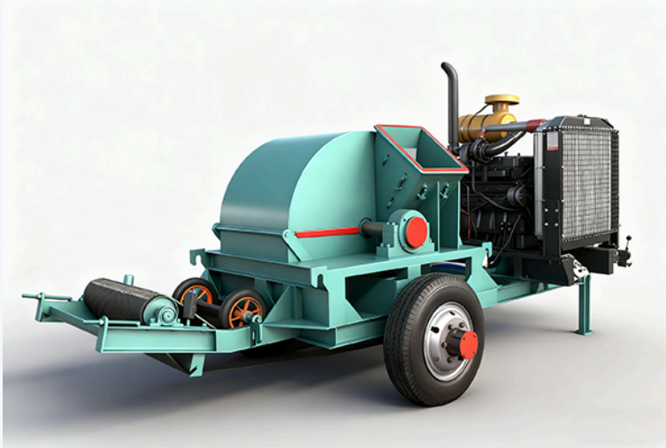
Mobile Disc Wood Crusher · Efficient & Stable Operation