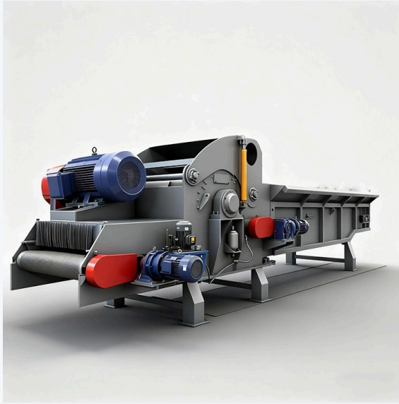
Comprehensive Wood Crusher · International Quality